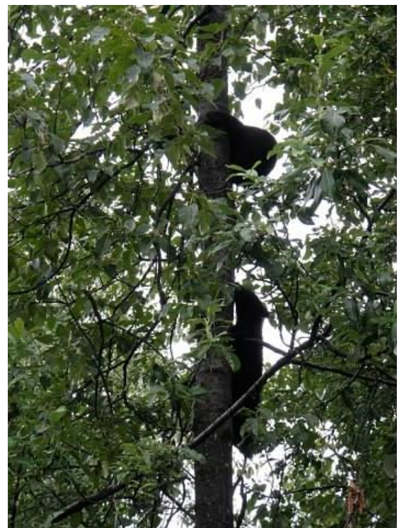
While the mother bear fished her cubs played in the trees